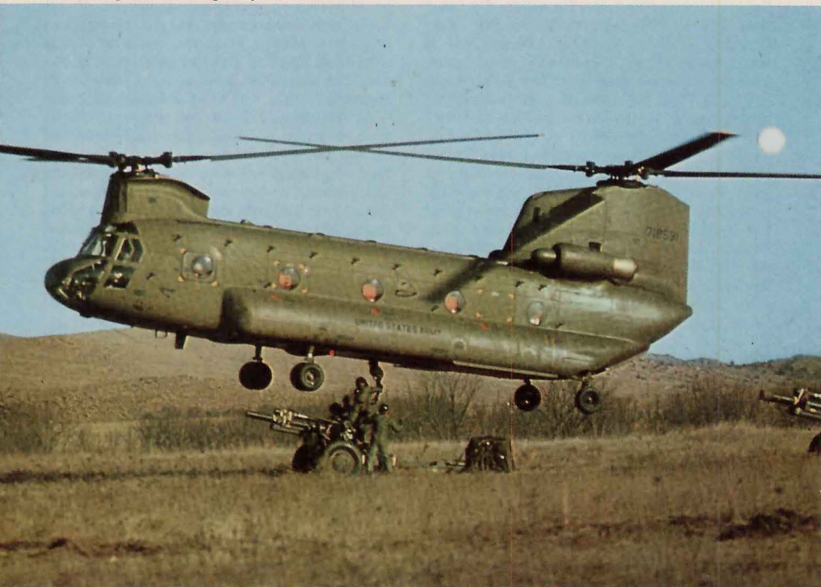
Air mobile operations during 5-day field exercise.

was transferred to Fort Riley, Kans., where it became part of the Ground General School. WAC officer candidate classes were discontinued in 1945 and reactivated at the WAC Training Center, Fort Lee, Va., in 1948. From 1948 to 1950, the WAC Officer Candidate School was the sole source of officers for the Women's Army Corps. WAC Officer Candidate classes were held concurrently with the direct commission courses from 1950 to 1956. Since 1956, they have been combined with the WAC Officer Basic classes conducted at the U.S. Women's Army Corps School, Fort McClellan, Ala.