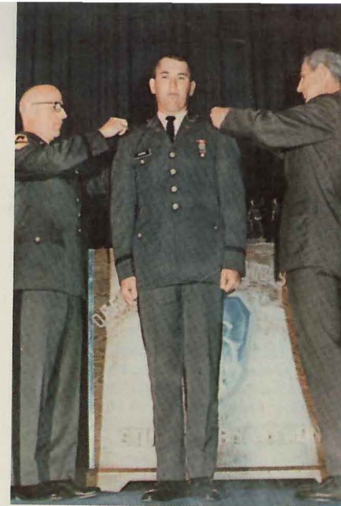
Graduation exercises at Infantry OCS.

But the accent in these things is decidedly on the word, "normally." If a messline were in an area under general fire, so that added waiting meant extra danger, then only a coward would insist on being fed first. And while an officer wouldn't be expected to pitch a tent, he would dig his own foxhole, unless he was well up in grade. At that, there were a few high commanders in World War II who made it a point of pride to do their own digging from first to last. Greater freedom of action can go out the window too, for conditions arise particularly in war when freedom of action cannot be per-