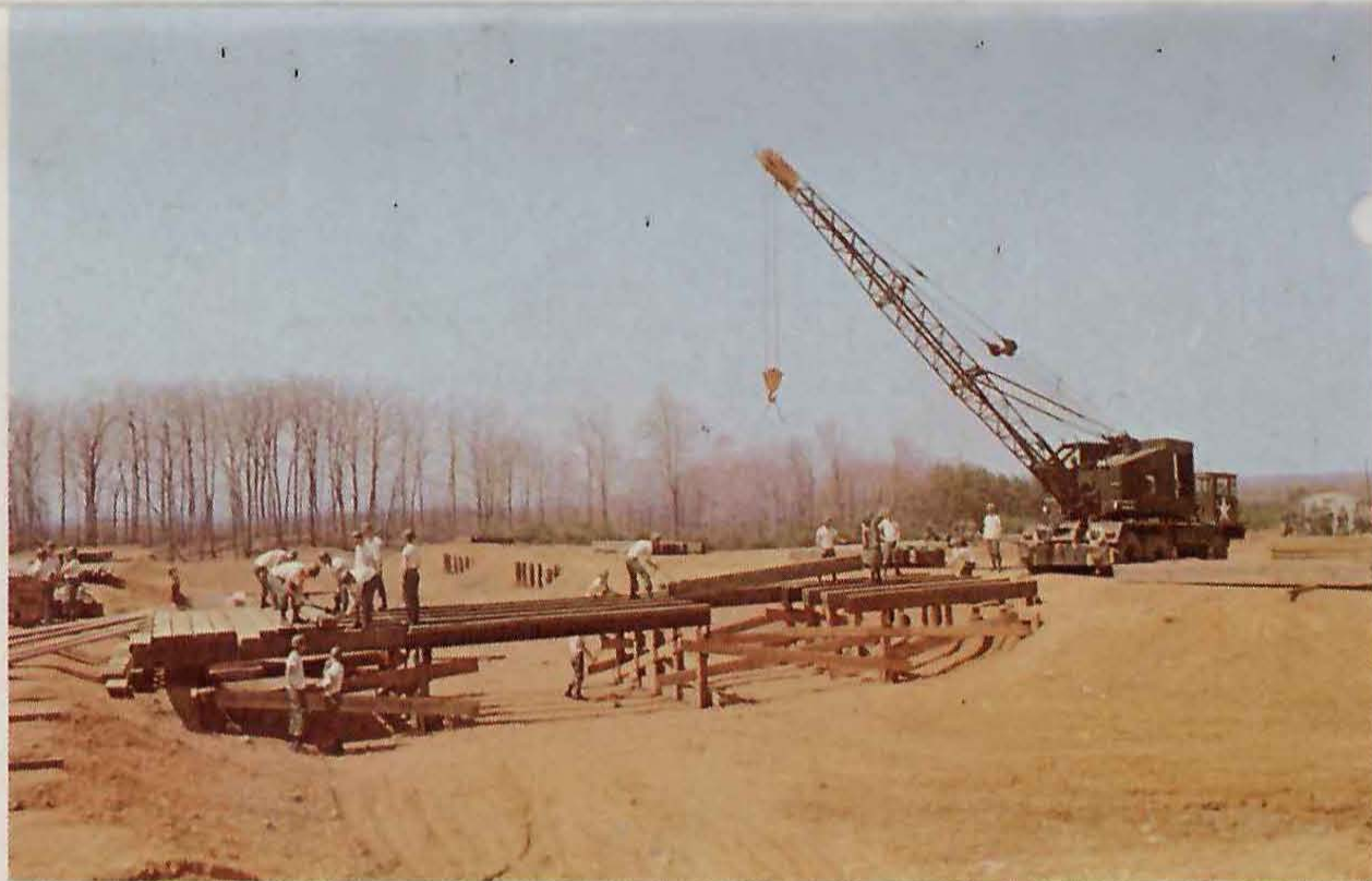
Engineer officer candidates nearing completion of constructing a bridge as part of their training.