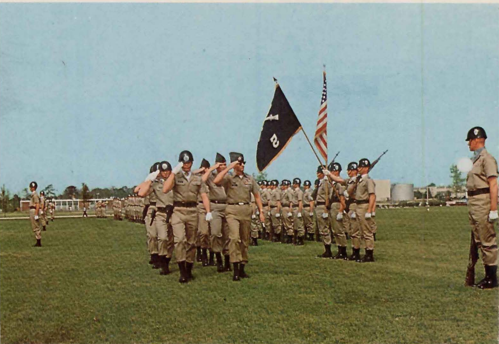
Retreat Parade - Infantry OCS.