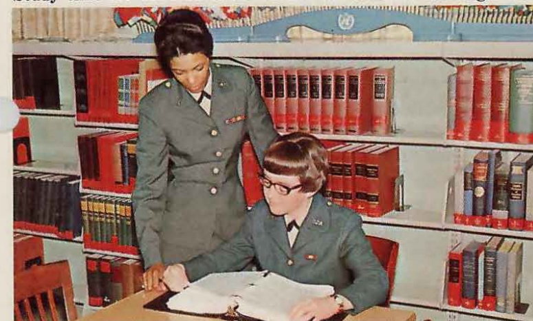
Study time for candidates in their final weeks of training.

The candidate's day at WAC OCS begins at 0530 hours. After breakfast and before starting the first morning class, the candidate must prepare her quarters for inspection. Students share a cubicle. In the barracks are study rooms, kitchens and laundry facilities. Furniture is modern and comfortable. Classes are five days a week from 0730 to 1630 hours and include in addition to academic subjects, close order drill and physical training.