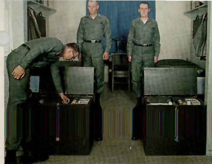
Inspection of lower class candidates by TAC officer - Artillery OCS.

You should be in good physical condition before going to school; however, Officer Candidate School has various methods of developing the physical stamina and coordination of an individual. Physical training begins the day you