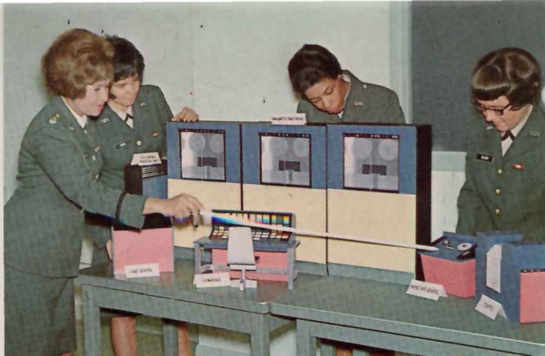
Classroom instruction in Automatic Data Processing at WAC OCS.