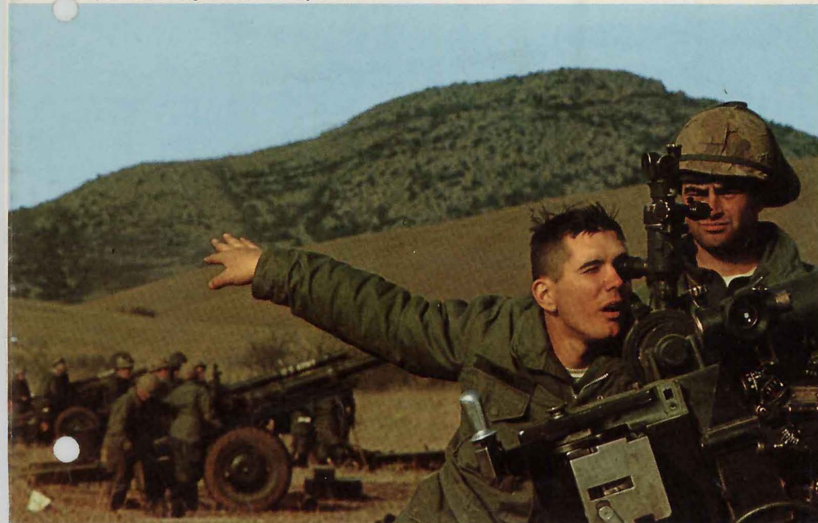
Putting out rear aiming stakes at Artillery OCS.

It is intended that a copy of this pamphlet be provided each individual eligible for OCS.