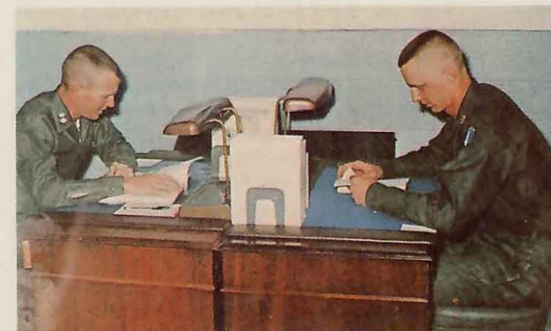
Study hour - Infantry OCS.