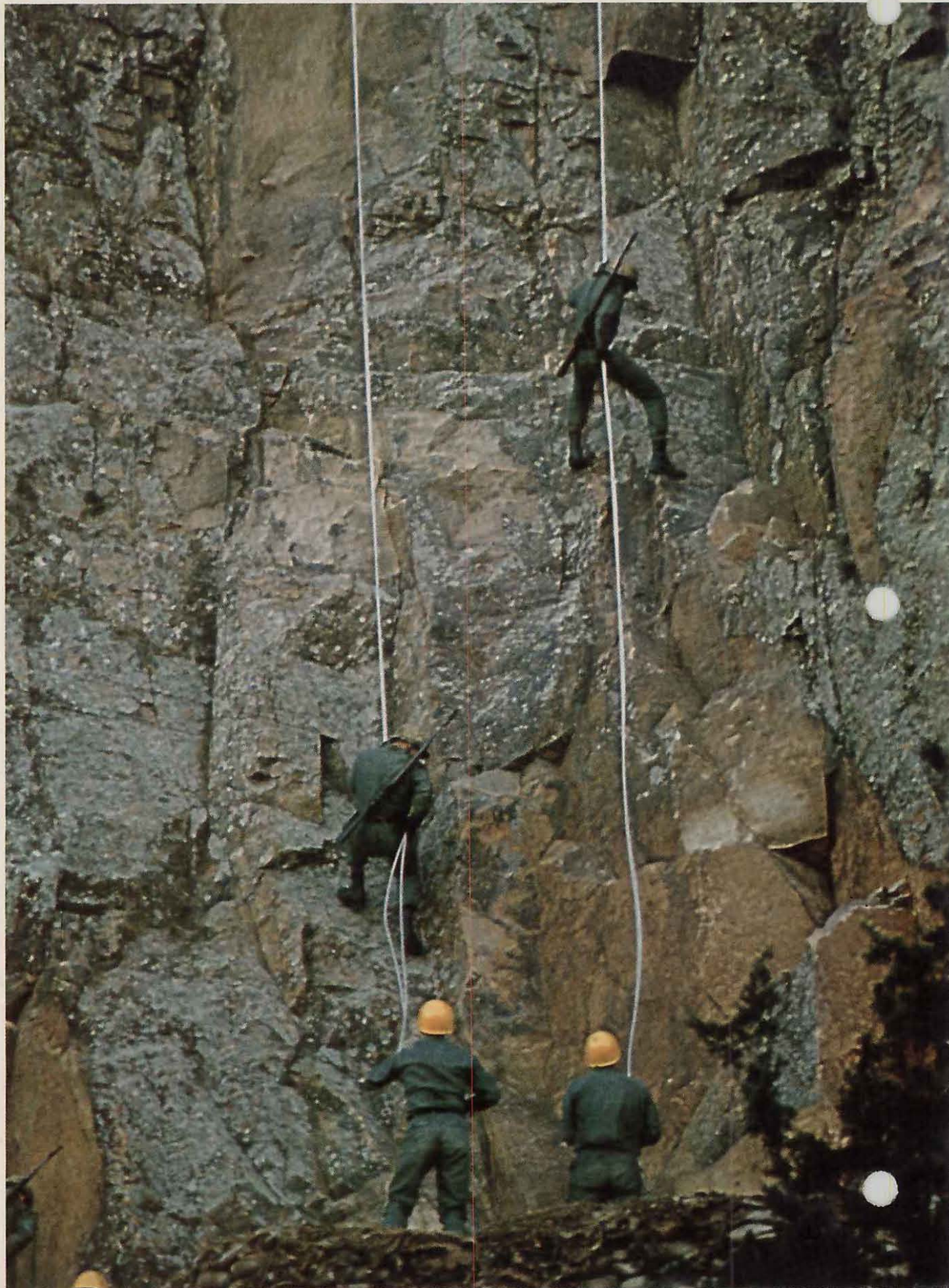
Artillery OCS candidates demonstrating rappelling techniques during field exercise.