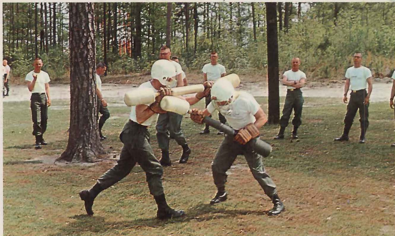
Candidates learn close combat techniques at Infantry OCS

To give the candidate the professional knowledge necessary to be a platoon leader, an extensive program of military subjects is presented. These subjects fall into three basic groups; weapons, tactics, and general subjects. The weapons instruction includes all weapons found in the infantry battalion, from the pistol to the 106 mm recoilless rifle. Tactics instruction is given at the platoon and company level