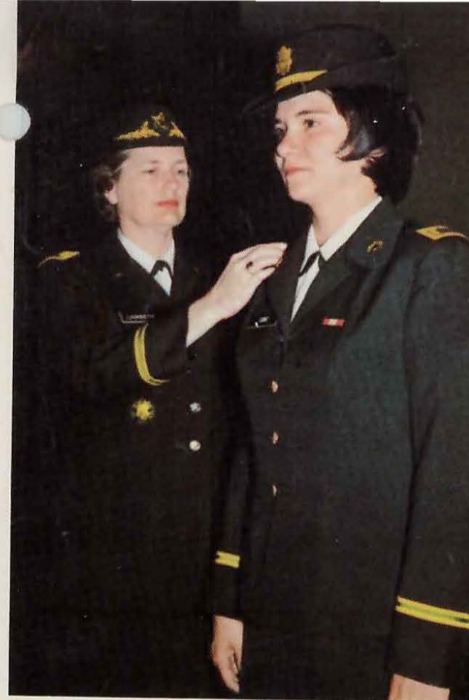
Officer candidate school graduate has her 2d lieutenant bars pinned on by a WAC officer.

Normally, an officer is not expected to buck a chowline, or any other queue in the line of duty, unless he is sensibly in a rush. The presumption is that his time is more valuable to the Service than that of an enlisted man. Normally, an officer is not expected to pitch a tent or spend his energy on any hard labor incidental to housekeeping. Normally, he has greater freedom of action and is less bound by minor restrictions than the ranks.