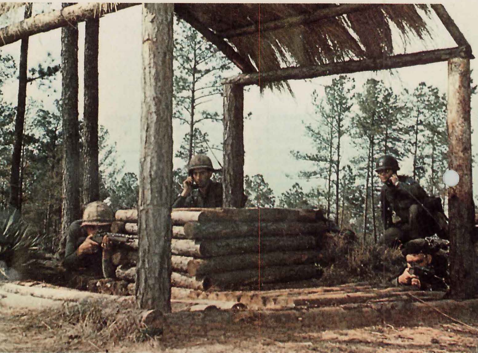
Field training exercise at Infantry OCS.