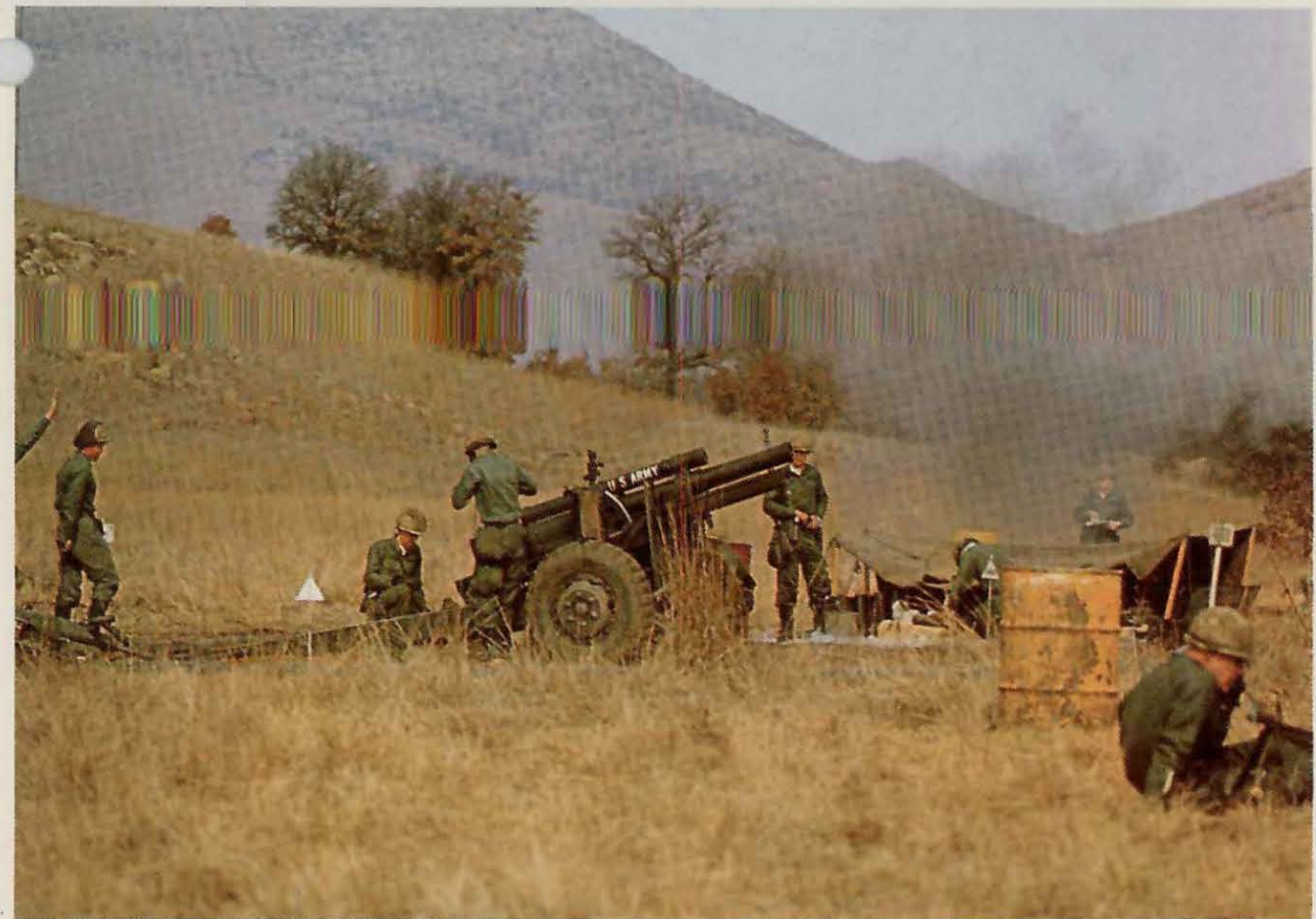
Artillery training in firing battery techniques - Artillery OCS.

Thereafter, a demanding academic and leadership course, a large portion of which is conducted in the field, begins in earnest. Two-thirds of the academic portion of instruction is presented by the U.S. Army Artillery and Missile School and the remainder by the Officer Candidate Brigade. Subjects taught by the U.S. Army Artillery and Missile School include communication equipment and procedures, artillery transport, gunnery and artillery material, guided missile system; tactics and general subjects; those taught by the Officer Candidate Brigade include leadership, individual weapons, first aid, Army information and other general subjects. Many of the classes on the latter subjects are taught by candidates, under the supervision of tactical officers. This provides the candidates an excellent opportunity for developing bearing and command voice while they gain practical experience and proficiency as instructors. The course is culminated by a 5½-day field problem conducted by the candidates for the purpose of giving them an opportunity to put into practice the principles learned in the classroom.