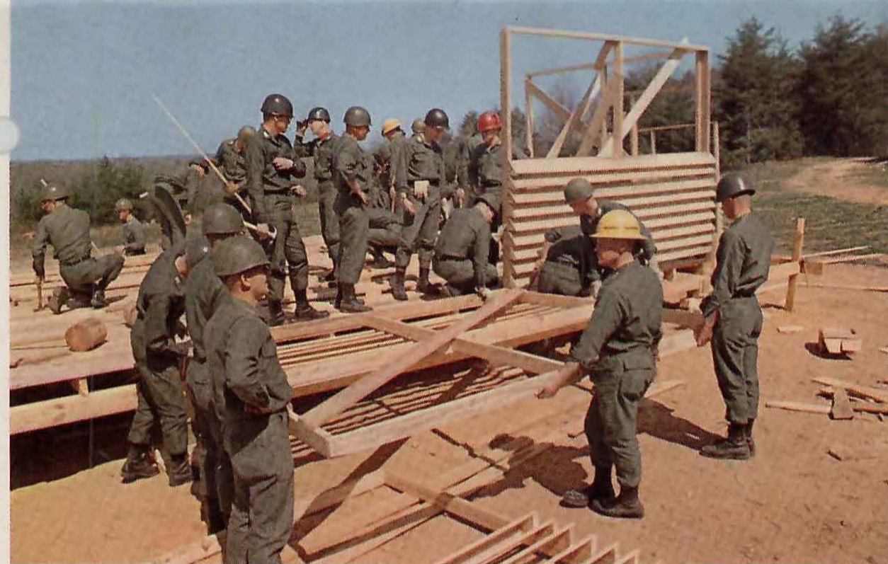
Engineer officer candidates receive instruction in building construction techniques.

The development of leadership ability, physi-