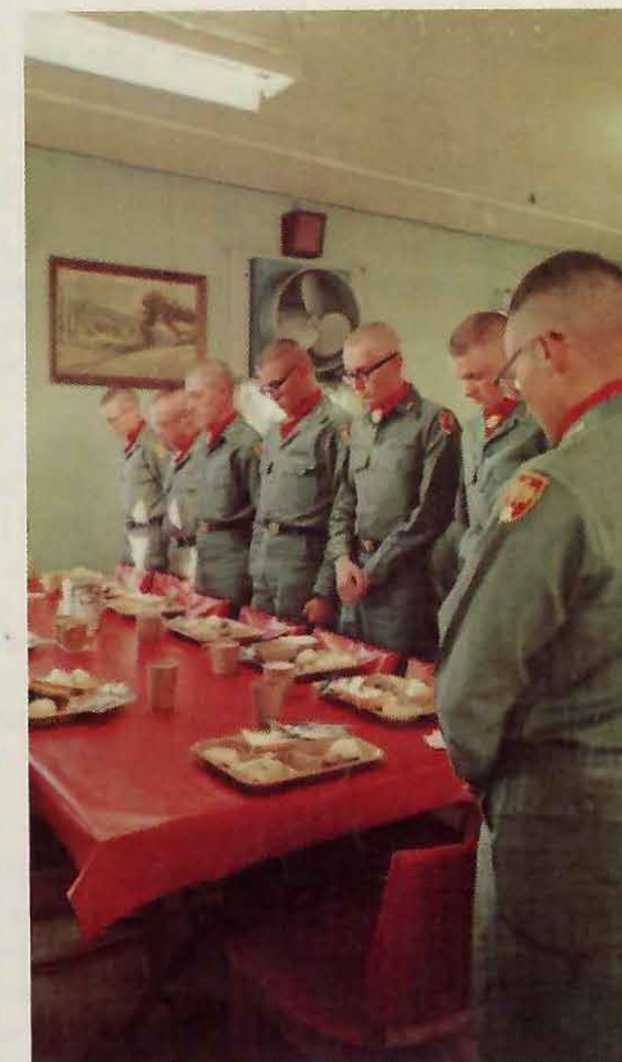
Prayer before meal - Artillery OCS.